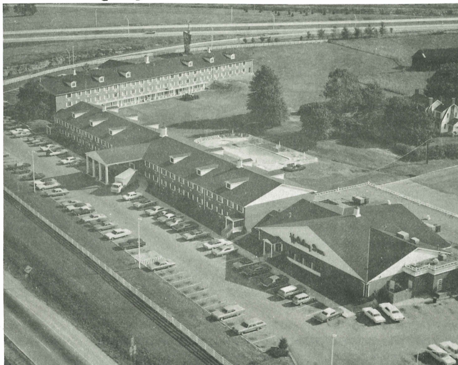
CONFERENCE SITE —The Holiday Inn (North) in Lexington will be the site of the 39th General Conference of the National Guard Association of Kentucky, on 10-11 April 1970. The motel is located on the Newtown Pike at the Junction of Interstate 75 (top of photo).